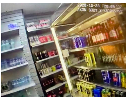
Two photos taken from Body Worn Video of PC NORTON showing the offence of displaying alcohol for sale without a licence. (Date and time stamped in top right hand corner).